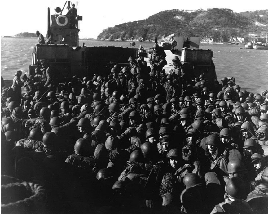
Photo # NH 97079 Troops aboard LSU-1317 at Inchon, Korea, Dec. 1950