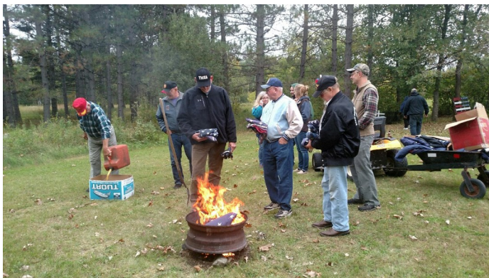
Post 1260 Annual Honor Guard rifle cleaning and flag retirements ceremony.