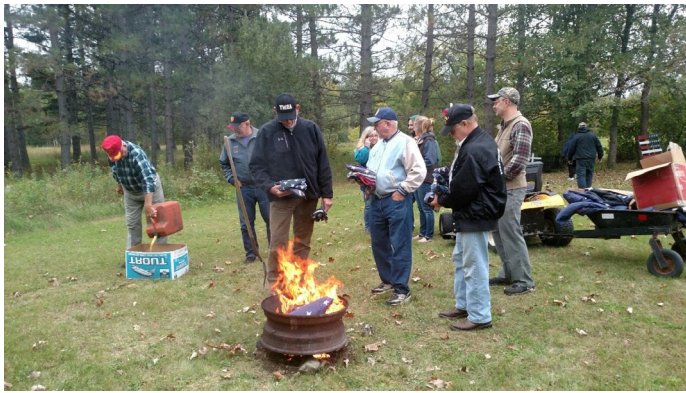
Post 1260 Annual Honor Guard rifle cleaning and flag retirements ceremony.